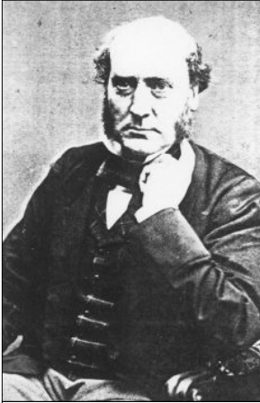
Sir George Gilbert Scott, Architect of All Saints Nocton.

At Nocton, Scott chose to imitate the 'Early Decorated' style of c.1300, then regarded as the 'best' period of Gothic architecture. Built with no expense spared, the church was probably begun in 1860, being consecrated on December the 16 th , 1862 and dedicated to All Saints: this was a new dedication, for previous Nocton churches had been dedicated to St. Peter. It was chosen in honour of Lord Ripon, whose birthday was November the first, or All Saints Day.