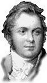
Frederick Robinson 1st Earl of Ripon

King George himself was less than delighted to hear that his statue had been set up in such a desolate spot. 'Ah, Lincolnshire', he remarked in disgust, 'all flats, fogs and fens!'. The statue was removed when Dunston Pillar was shortened by the R.A.F. during the second World War: