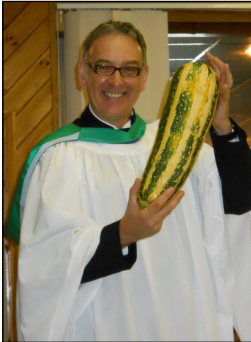
Multi-tasking - Preacher to Auctioneer in 10 Minutes

Although the weather on the day proved to be slightly damp there was no dampening of spirits of the participants. There were an amazing 103 entries for the produce show which included perfectly formed fruit and vegetables, delectable cakes, artistic flower displays and tasty preserves.