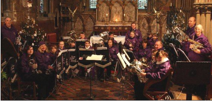
The Band Playing at All Saints, Nocton - 19th Dec 2010

The Silver Silver Sounds Band is a small local group who have performed a number of times in Nocton recently to really positive acclaim. They encourage and give the opportunity for young brass players to develop their skills, playing with those of many years experience. All Saints, Church was pleased to be able to support them through our Tree Festival.